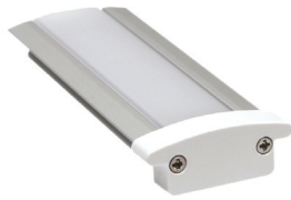
shown with closed end cap