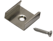
mounting clip & screw

The Naro models of Continua Channels are designed for recessing into wood, cabinetry, and indoor materials and provide an excellent heat sink to cool and prolong the life of LED tape light. Naro 1 is Alloy LED's most low-profile recessed channel and features a lip on each side of the channel for a clean installation. Can be configured for installation in wet locations using dry location LED tape light.